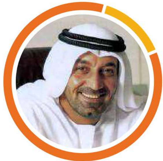
H.H. Sheikh Ahmed bin Saeed Al Maktoum Chairman and Chief Executive, Emirates Airline and Group Chairman, Dubai Airports Event Patron

The exhibition will be complimented with an international conference, demonstration and sports